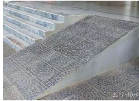
Ramp in D Block