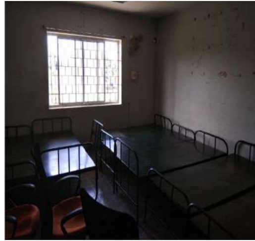
Rest Room for Boys