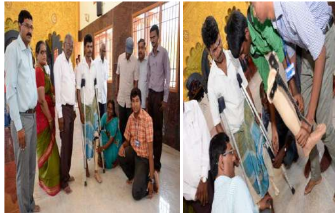
Distribution of Free artificial Limb