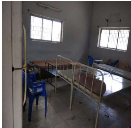
Rest room for Girls