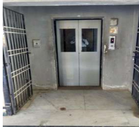
Lift facilities in D & E Block