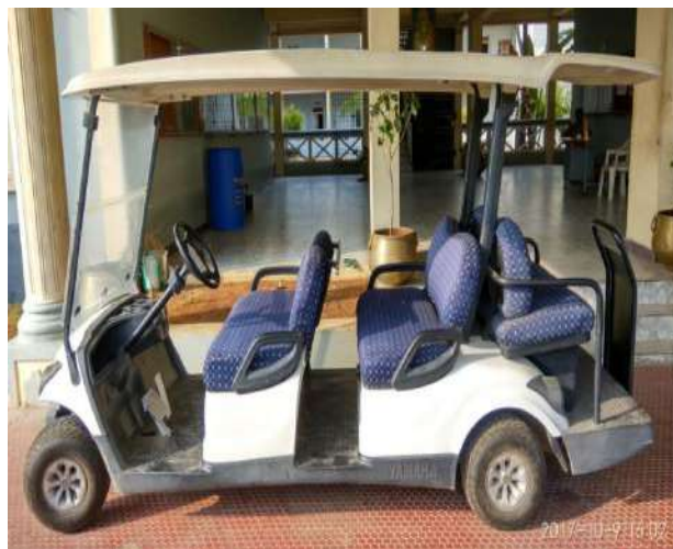
Battery Operated Car