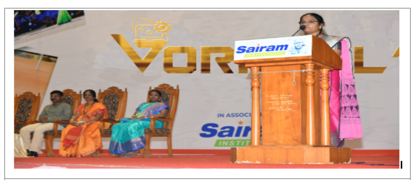
HOD ADDRESS ON INAUGURATION OF VORFALL'22