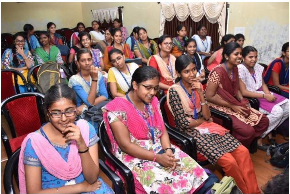
Group of students benefited by the Programme