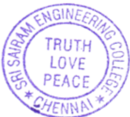
Principal SRI SAIRAM ENGINEERING COLLEGE West Tambaram, Chennai-44.