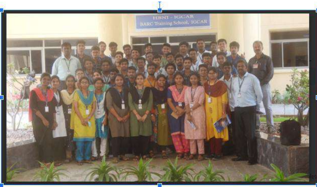
INDUSTRIAL VISIT TO IGCAR, Kalpakkam