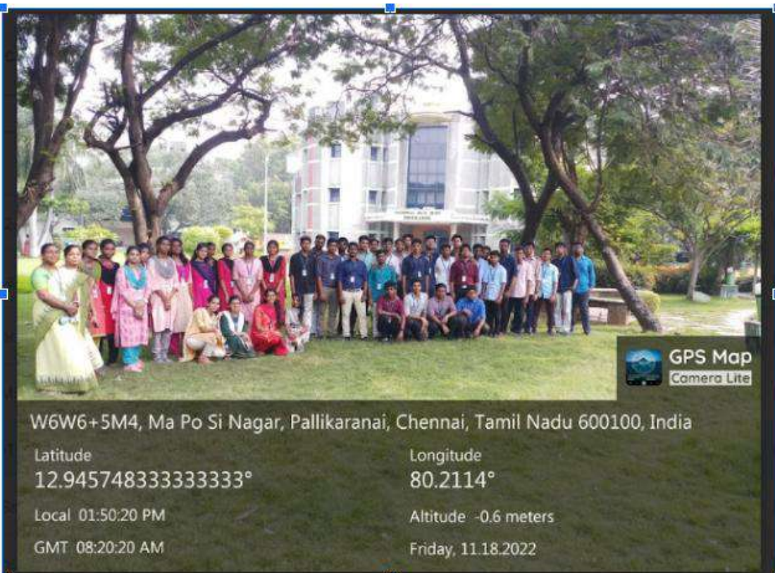
INDUSTRIAL VISIT TO NIOT , Pallikaranai